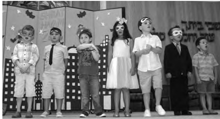
Shirat Hayam Preschool Graduation